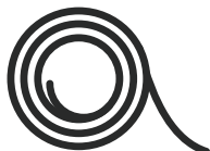
6' Sticker-Tite Rubber Gasket